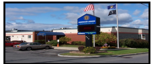
Melvin Roads Post 1231 200 Columbia Turnpike Rensselaer, New York 12144