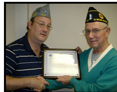
Press Association Award Presentation

year the NYALPA holds a communications contest for various categories. This "American Legion Post 1231" newsletter has won recognition for the second year in a row, this year being awarded second place in the Post Publications with over 300 members category. Special Recognition was also awarded for the bi-monthly calendar.