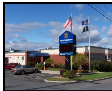
Melvin Roads Post 1231 Columbia Turnpike Rensselaer, New York 12144