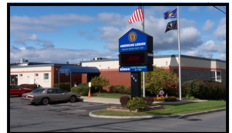
Melvin Roads Post 1231 200 Columbia Turnpike Rensselaer, New York 12144