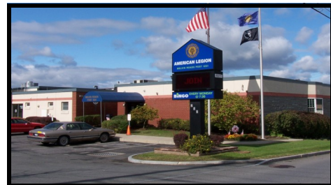
Melvin Roads Post 1231 200 Columbia Turnpike Rensselaer, New York 12144